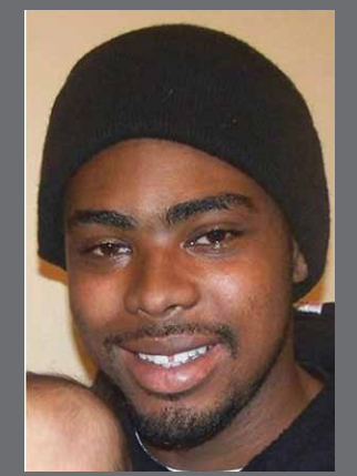
Oscar Grant Oakland, CA 2009