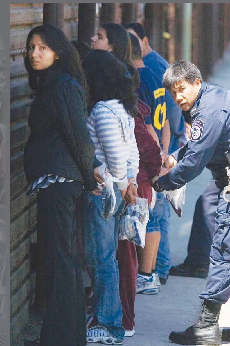
Above: Immigrants in process of deportation, 2008. (Photo: AP) Left above: Overcrowded California prison, 2007. (Photo: AP) Left below: October 22, 2009 protest in NYC. (Photo: Li Onesto/Revolution) Center: Outside trial of the cop who murdered Oscar Grant, 2010. (Photo: AP)

Below is from the Message and Call of the Revolutionary Communist Party, USA (RCP), "The Revolution We Need... The Leadership We Have," available at revcom.us :