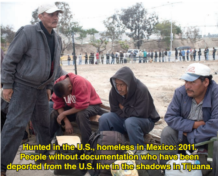
Hunted in the U.S., homeless in Mexico: 2011. People without documentation who have been deported from the U.S. live in the shadows in Tijuana.