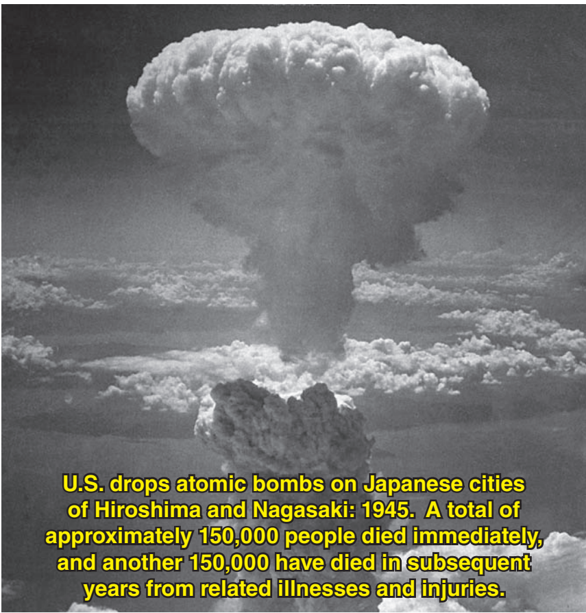
U.S. drops atomic bombs on Japanese cities of Hiroshima and Nagasaki: 1945. A total of approximately 150,000 people died immediately, and another 150,000 have died in subsequent years from related illnesses and injuries.