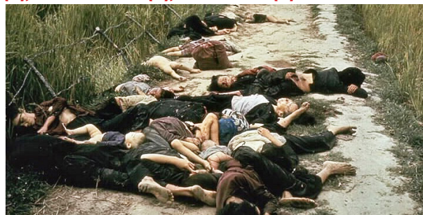
Villagers in My Lai, Vietnam, massacred by U.S. troops, March 16, 1968.

Eisenhower (R), John Kennedy (D), Lyndon B. Johnson (D), Richard Nixon (R), Gerald Ford (R)