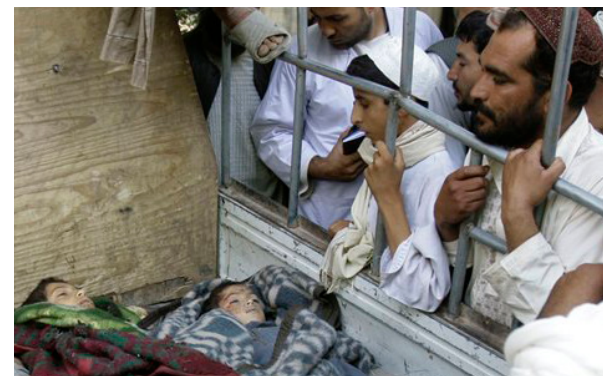
Children killed in U.S. air war in Afghanistan, 2009.

George W. Bush (R), Obama (D), Trump (R), Biden (D)