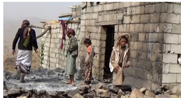
U.S.-backed Saudi Arabia airstrike on Yemen, 2015.

In March 2015, Saudi Arabia, with U.S. backing, launched a war against Yemen's Houthi movement. Since then, over 150,000 people have been killed. The Saudis have bombed Yemen's food, water, and medical systems, causing massive hunger and disease. As many as 400,000 children have starved to death as a result.