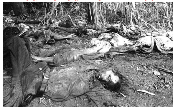
Massacre by U.S.-backed Salvadoran military in El Mozote, December 1981.

Carter (D), Reagan (R), George H.W. Bush (R)