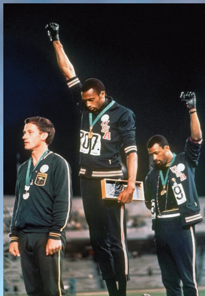
John Carlos (right) and Tommie Smith (center), along with Peter Norman, at the medals ceremony for the 200 meters at the 1968 Olympic Games, Mexico City.

Between the anti-war protesters and the war planners in the Pentagon; between the Black Panthers and J. Edgar Hoover; between Black, Latino, Asian, and Native peoples on the one side and the government on the other; between the women who rebelled against their "traditional" roles and the rich old men who ruled the country; between the youth who brought forward new music, in the broadest sense, and the preachers who denounced them as disciples of the devil and despoilers of civilization: the battle lines were sharply drawn. And through the course of those tumultuous times, those who were rebelling against the established order and the dominating relations and traditions increasingly found common cause and powerful unity; they increasingly gained—and deserved—the moral as well as political initiative, while the ruling class dug in and lashed out to defend its rule, but increasingly, and very deservedly, lost moral and political authority.