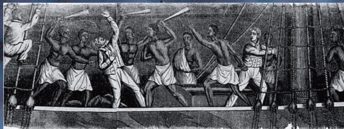
Depiction of the 1839 rebellion on the slave ship Amistad off the coast of Cuba.