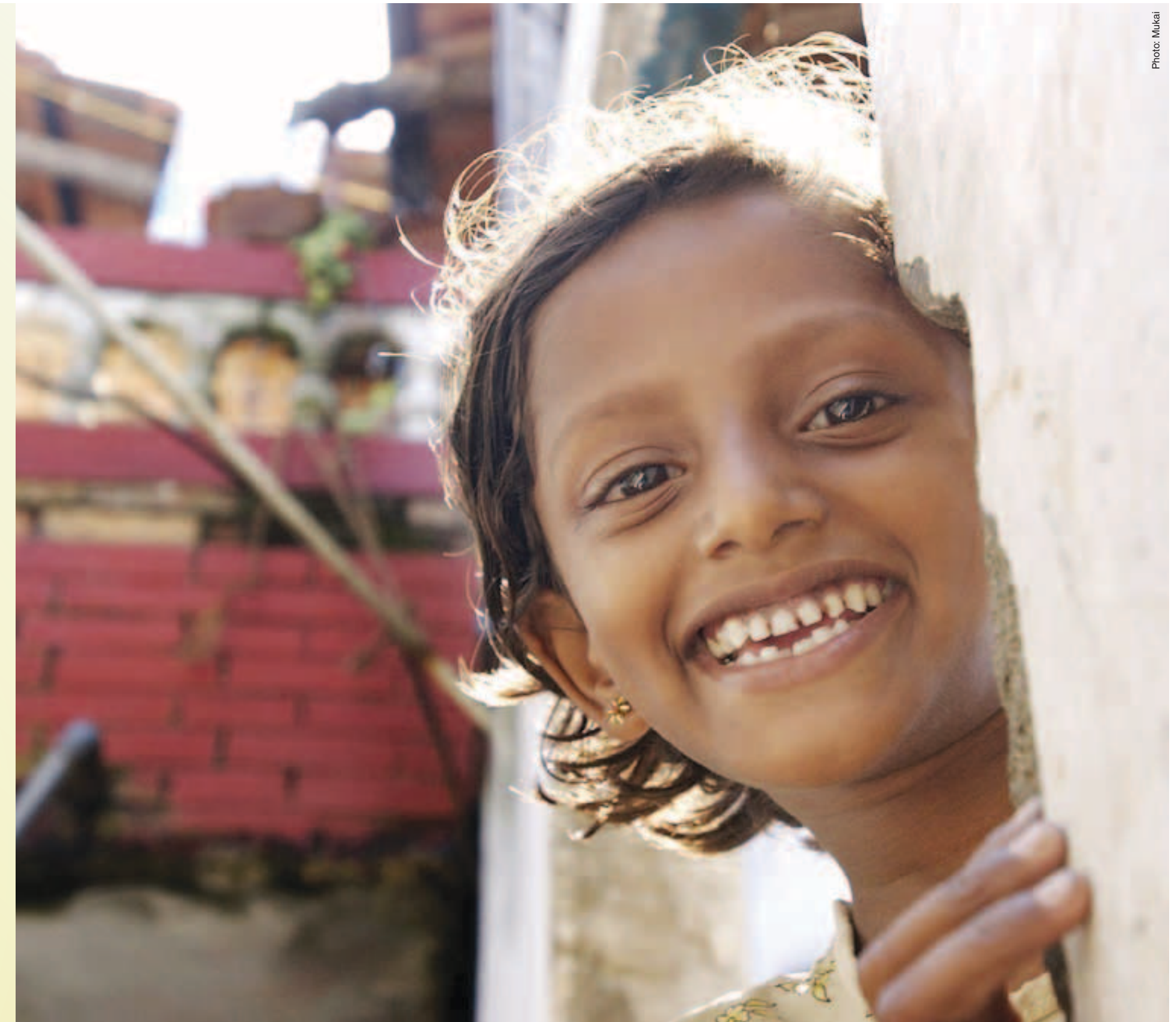
Sri Lanka, 2004