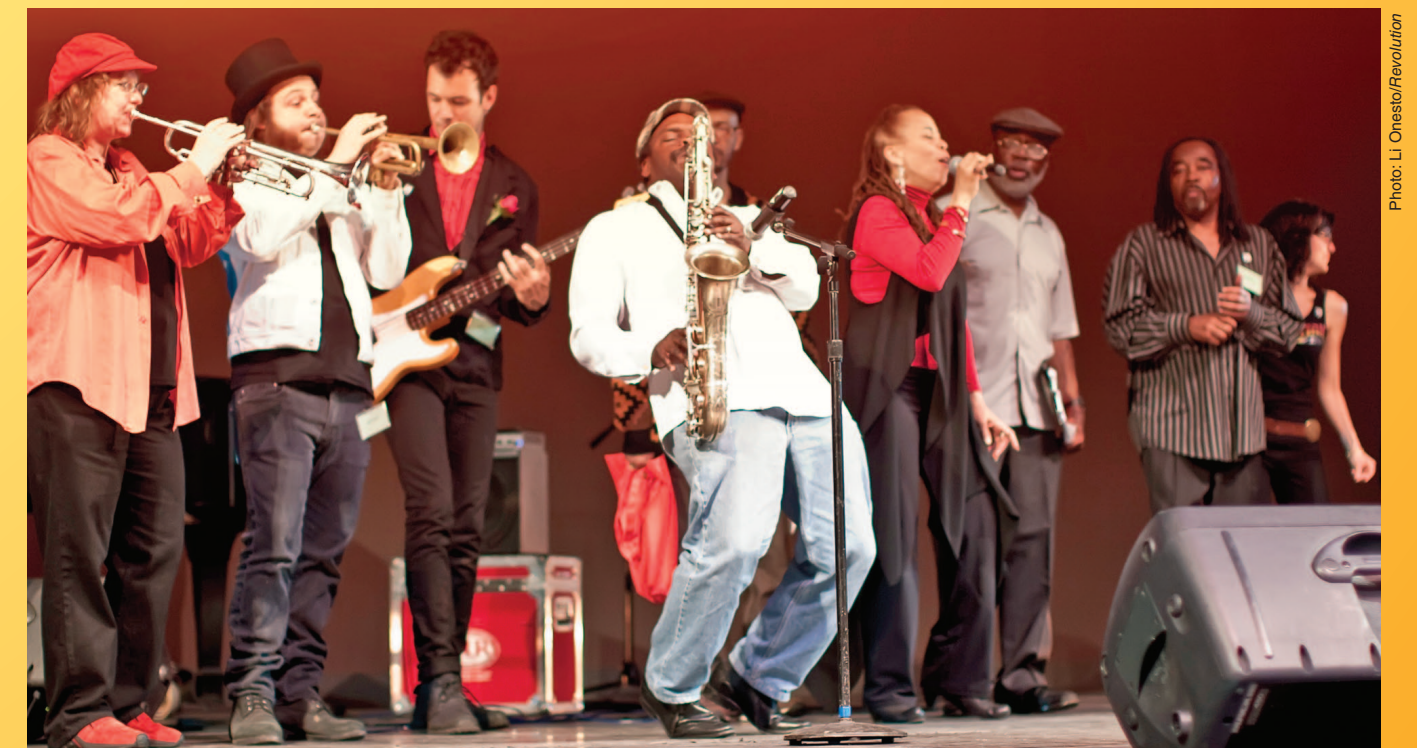
On stage at "On the Occasion of the Publication of BASics : A Celebration of Revolution and the Vision of a New World," April 11, 2011.

BA Everywhere has pulsed with radical culture—the participation of poets, rappers, and musicians...from the parks and street corners to the theaters and jazz clubs. This needs to be taken to a new level in 2013, including new ways of documenting the special connection between BA and the voices of those cast on the bottom of society engaging the biggest questions of the revolution. Stay tuned for word about the release of the film about a very special event held in spring 2011, On the Occasion of the Publication of BASics: A Celebration of Revolution and the Vision of a New World .