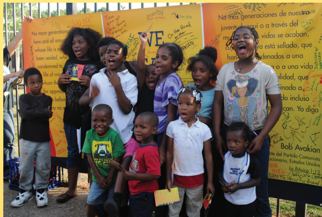
With the BASics Bus Tour in Atlanta, GA, 2012.