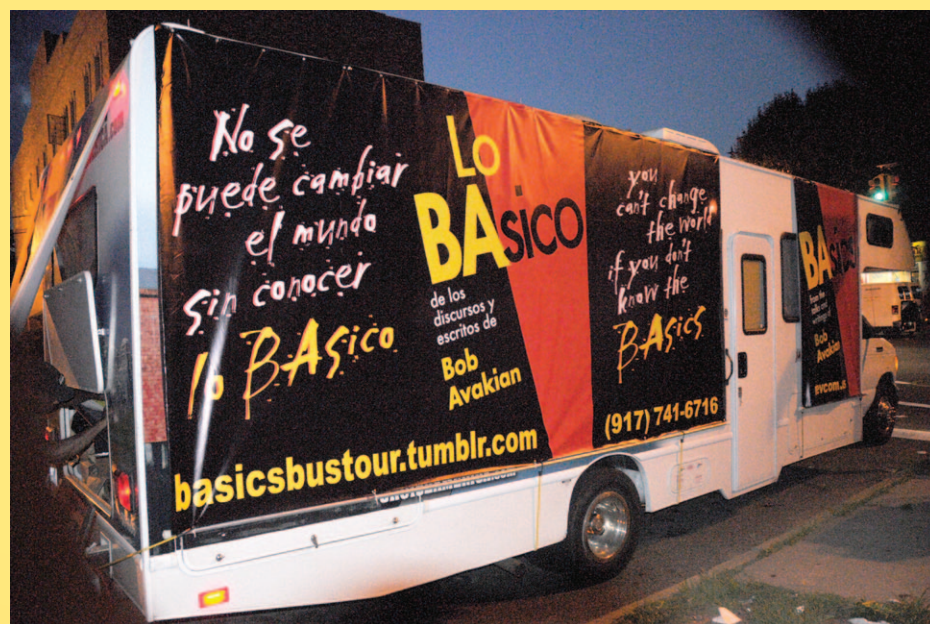
The BASics Bus

Three BASics Bus Tours: 1) through California, 2) from Atlanta, GA to Sanford, FL (where Trayvon Martin was killed), 3) through the urban hellholes of New York City and surrounding areas—brought this campaign to those who catch the most hell every day under this system. Multinational, multigenerational crews of volunteers connected BA's voice directly to the people through spreading BASics, showings of BA's talk Revolution: Why It's Necessary, Why It's Possible, What It's All About , and more. Across the country, people contributed to the tours and followed them online.