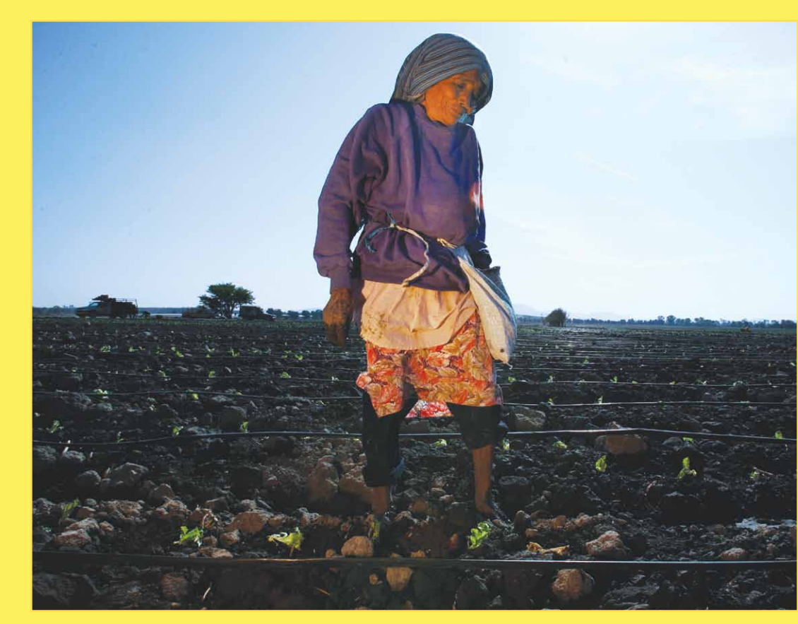
2008. 74-year-old woman working on a lettuce plantation belonging to a U.S. owned company near San Miguel de Allende in central Mexico. American companies farm more than 45,000 acres of land in three Mexican states, employing about 11,000 people, according to a 2007 survey by the U.S. farm group Western Growers.

Throughout the 20th century, U.S. capital expanded into and increasingly dominated the Mexican economy. Today, financial institutions like the World Bank and the International Monetary Fund—which are dominated by the U.S.—pressure the Mexican government to promote farm crops that can be sold on the world market and industry that uses low-paid, super-exploited Mexican labor to produce low-cost goods for the world market. Land and resources have been shifted away from basic food production and the Mexican economy is distorted to serve the demands of international imperialist capital.