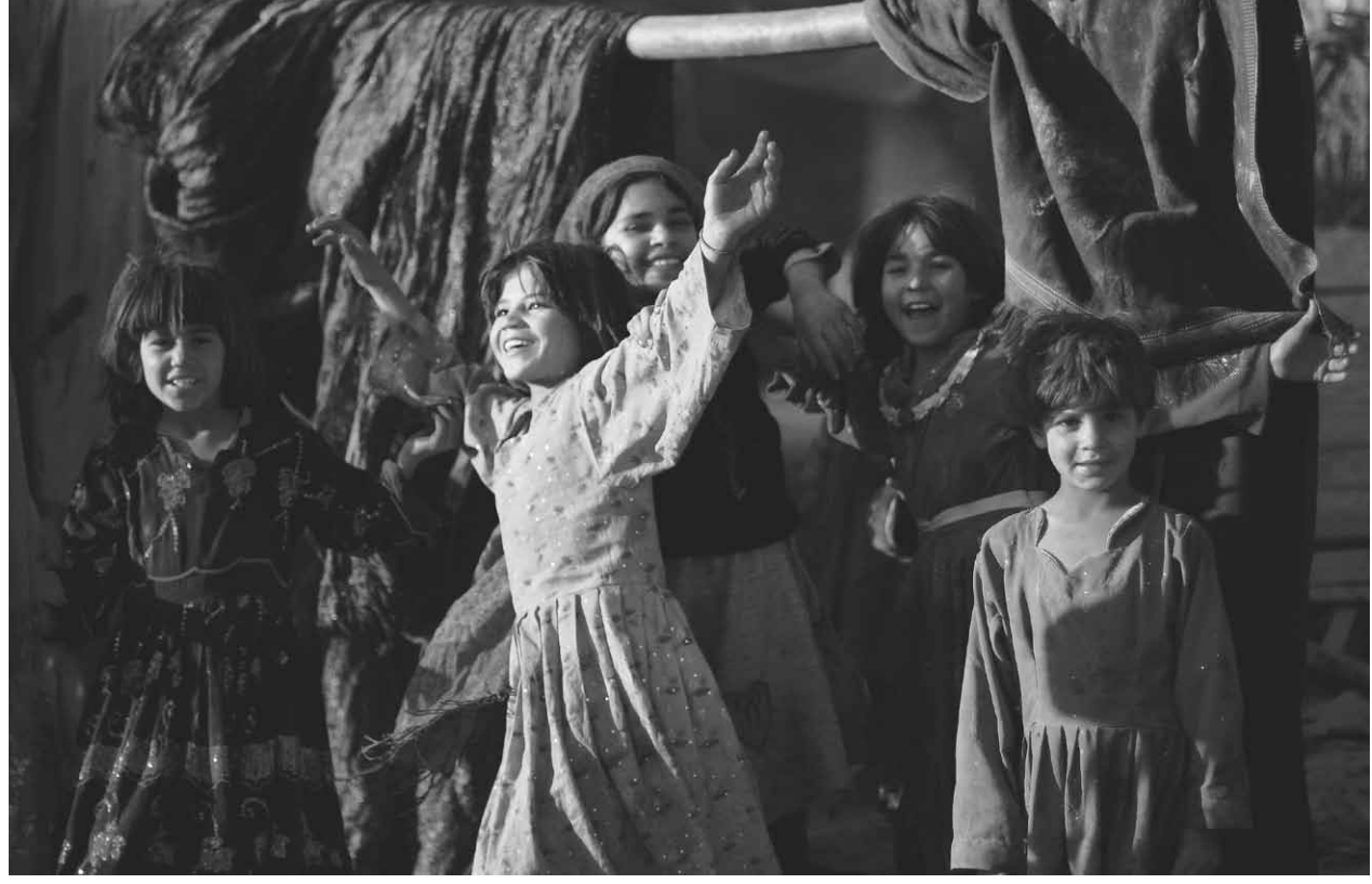
Above: December 2009, Pakistan. Afghan refugee girls playing.

Young women in the millions are traded like cattle and forced into sexual slavery, shipped across countries and continents, while women everywhere are degraded, demeaned, and brutalized in a thousand ways—beaten and raped in huge numbers, treated as objects of sexual gratification and breeders of children instead of full human beings. The idea of an intimate loving relationship with another human being is made into a sick joke, perverted into a property or commodity relation, weighed down by repressive patriarchal tradition and denied or restricted for people of the same sex.