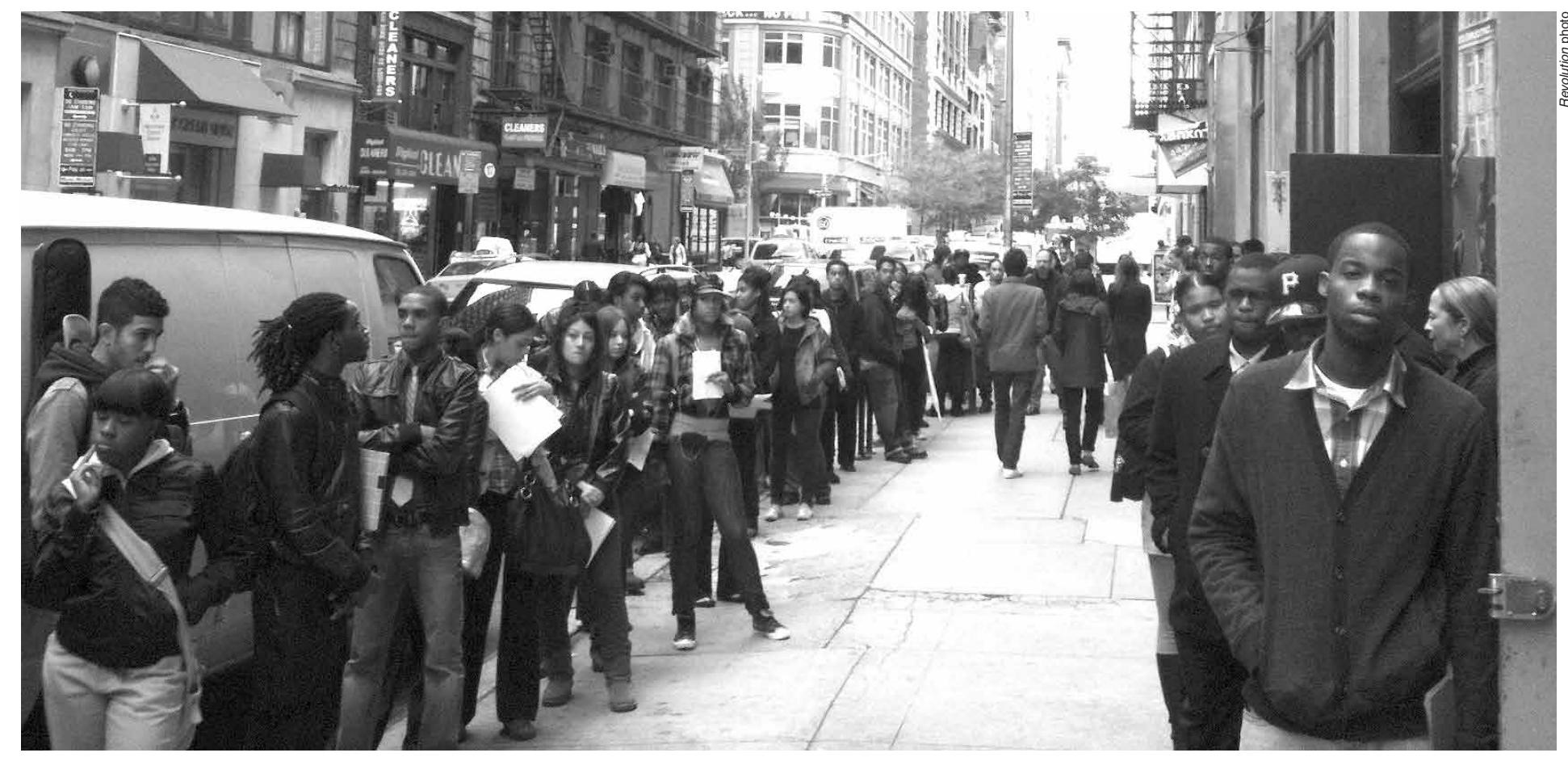
October 2010. Youth in line to apply for jobs, Manhattan.

Look at what this system is doing to youth right here in the USA. For millions in the inner cities, if they are not killed at an early age, their likely future is prison (nearly 1 in 8 young Black men is incarcerated, the prisons are overflowing with Blacks and Latinos, and this country has the highest rate of incarceration of women in the world). This system has robbed so many youth of the chance for a decent life and has got far too many living, dying and killing for nothing—nothing good—nothing more than messing up people and murdering each other on the streets of the cities here...or joining the military, being trained