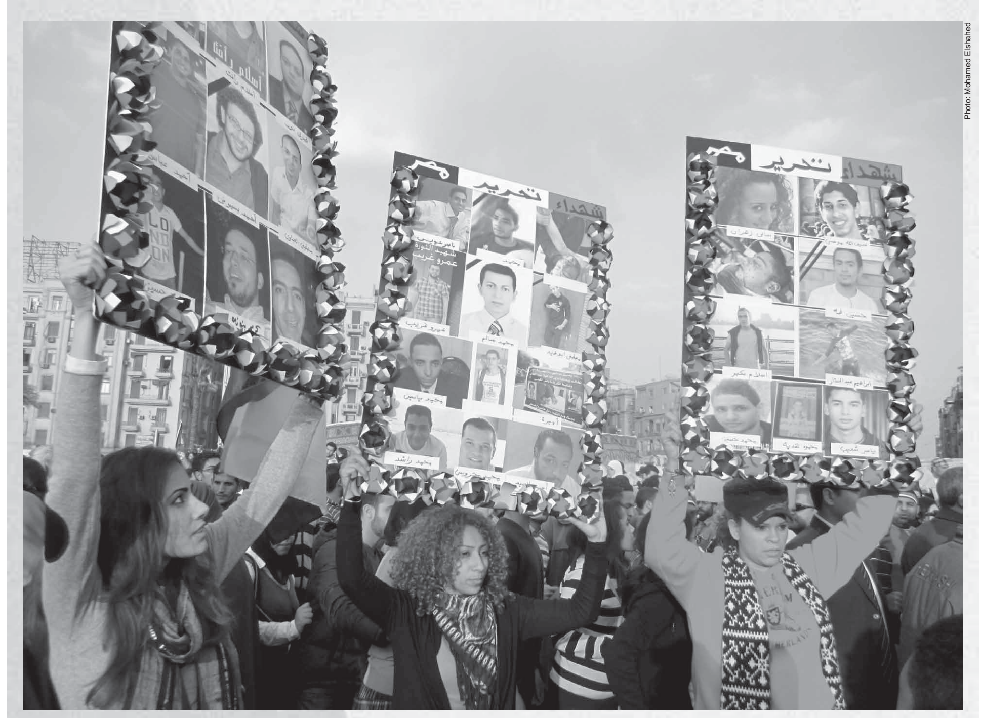
Cairo, February 8, 2011: Protestors carrying posters showing men and women killed by state security.

Read the entire statement online in English, Arabic, Spanish and other languages at revcom.us.