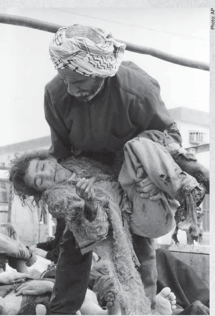
2003, Irag: Young girl wounded after U.S. air strikes over the city of Basr