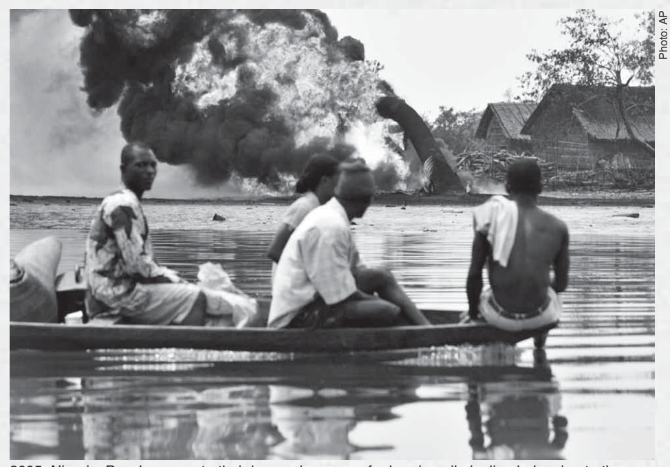
2005, Nigeria: People evacuate their homes because of a burning oil pipeline belonging to the Shell Petroleum Development Company.