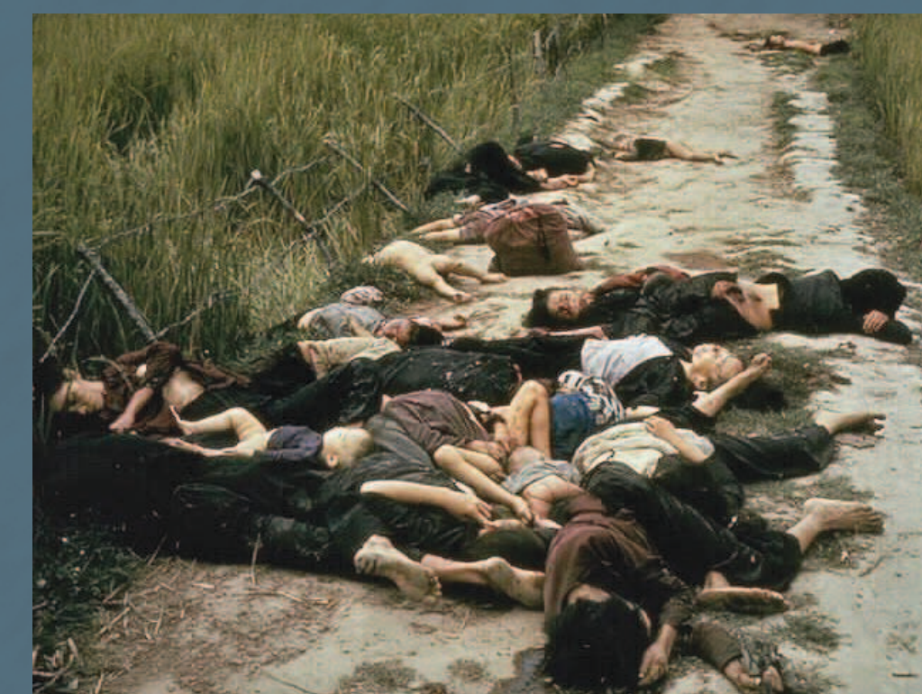
March 16, 1968—a company of U.S. soldiers went into the Vietnamese village of My Lai with orders to kill everyone and destroy everything. The troops forced more than 400 villagers—mostly women, children, and old men—into a ditch and shot them (above). Some women were raped before being killed. Corpses were mutilated. The My Lai massacre became a symbol of the massive brutality and horror of the U.S. war against Vietnam.