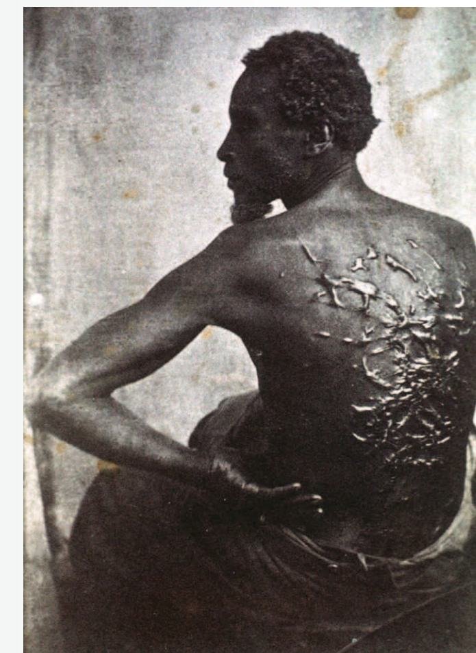
Gordon, an escaped slave from Mississippi, 1863. His back is scarred from a whipping after an earlier failed escape. Gordon joined the Union army and fought in the Civil War.

America is a terrorist with a Howdy Doody grin