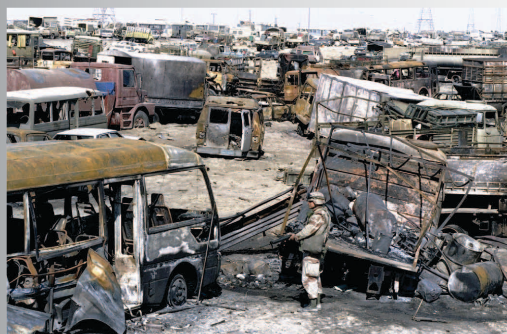
January 16, 1991—the U.S. launched war against Iraq. Hundreds of thousands of Iraqis were killed or injured. Bombing destroyed bridges, electrical plants, and water treatment plants. Defeated Iraqi troops, along with many civilians, fled on the highway out of Kuwait. For 48 hours U.S. jets attacked this clogged highway with incendiary bombs, turning it into a firestorm. More than 25,000 fleeing civilians and soldiers were killed on this "Highway of Death."