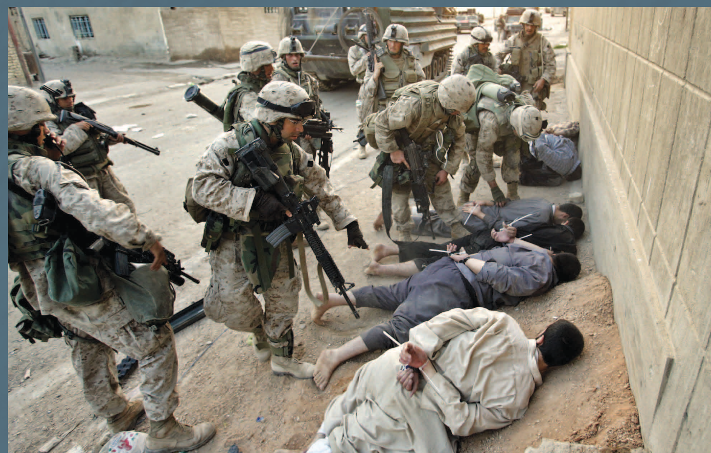
Fallujah, Iraq, 2004—the U.S. invaded Iraq in March 2003 based on brazen lies about “weapons of mass destruction.” For the people of Iraq, the U.S. war and occupation has meant air strikes on villages, torture and murder in prisons, mass round-ups, and millions displaced from their homes. In April 2004, the U.S. laid siege on the city of Fallujah for 10 horrifying days and then carried out a massive assault in November, killing over a thousand people.

It should be obvious by now that this country is deranged.