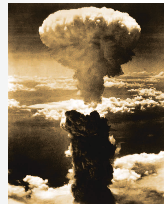
August 1945—in the last days of World War 2, the U.S. dropped atomic bombs on the Japanese cities of Hiroshima and Nagasaki. More than 200,000 people were instantly killed, and 130,000 more died later from cancer and other long-term effects. The U.S. remains the only country that has used nuclear weapons in war.

To take away the humanity of a darker race Put people in chains, then beat them with whips Made them give up their names Those who survived the slave ship.