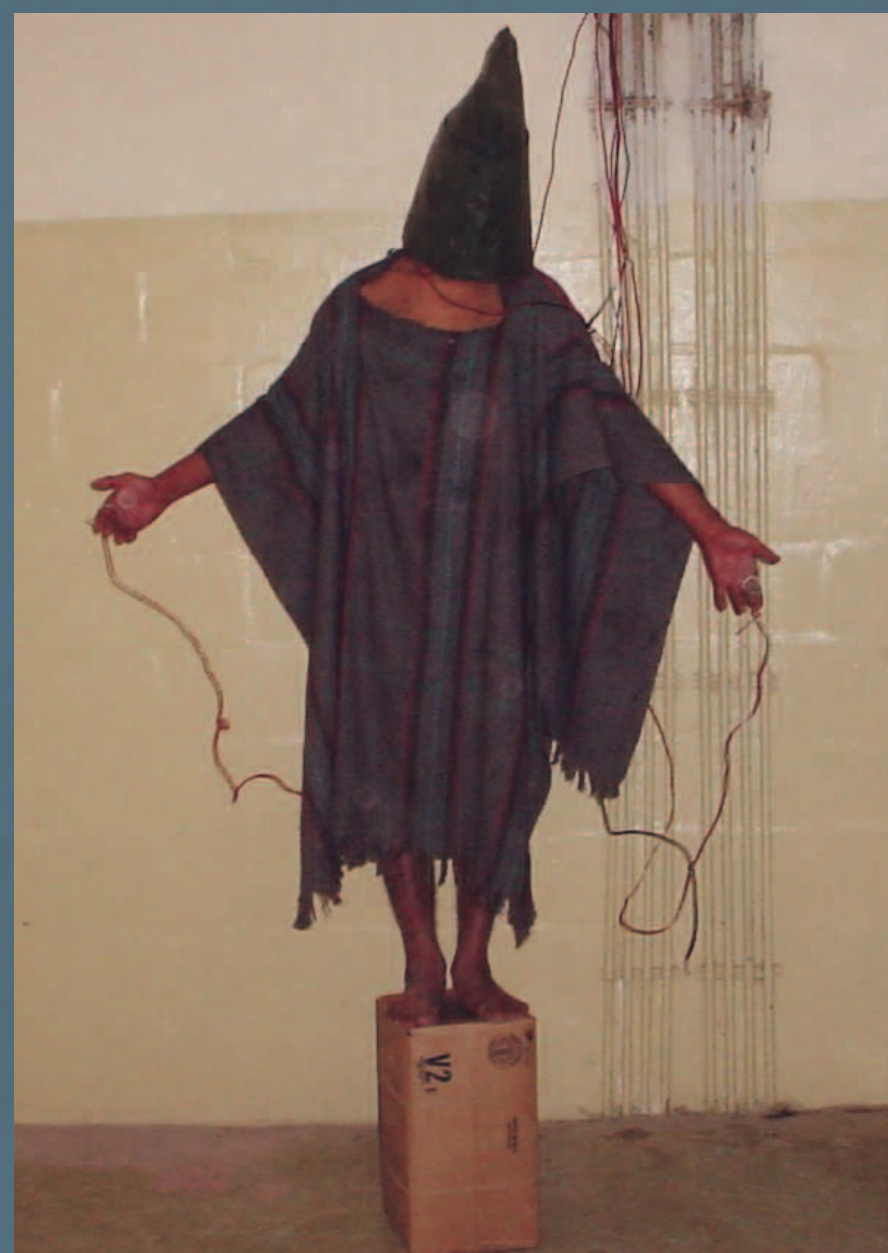
An Iraqi prisoner being tortured by U.S. troops at Abu Ghraib prison—one of many tortured there, some of whom were killed, after the 2003 U.S. invasion.

America is a terrorist and no one wants to admit