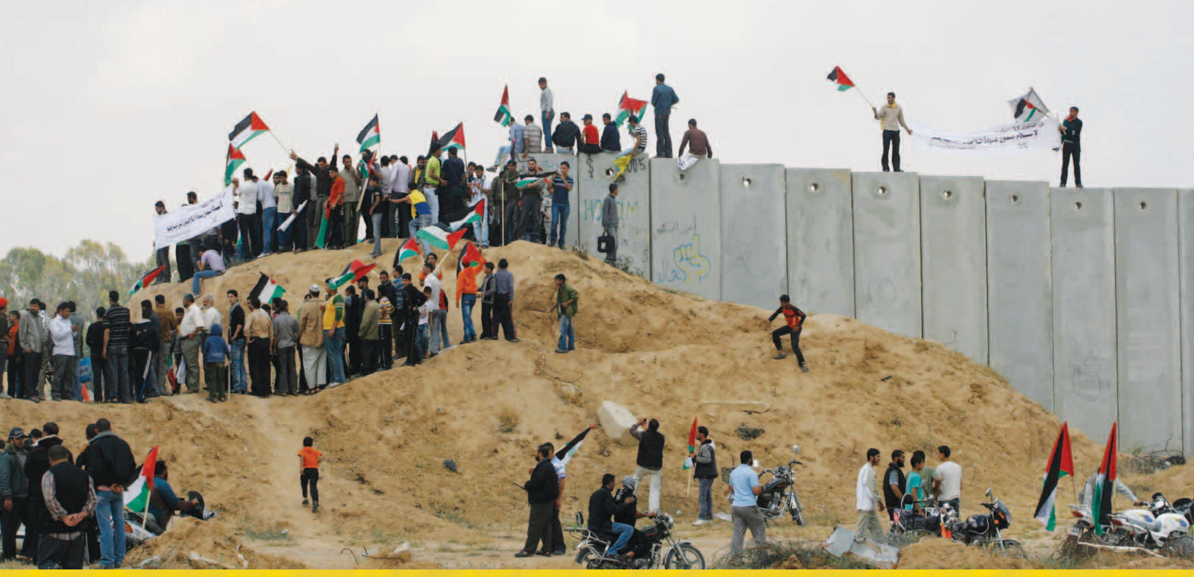
May 15, 2011, protesters at the Rafah border crossing between Egypt and the Gaza Strip. Some 1.5 million Palestinians driven from what is now Israel, and their families, live in Gaza.

Israel has been a catastrophe for the people of the world. Look up Israel's "special relationship" with apartheid South Africa when that openly racist regime was isolated and exposed. Look up the role of Israel in the "dirty war" of terror waged by Argentina's fascist (and virulently anti-Semitic) junta against radicals and dissidents from 1976 to 1983. Or Israel's role in backing the Shah of Iran. Or look up what happened in Guatemala, from 1978 to 1984 when the Christian fundamentalist butcher Ríos Montt killed at least 180,000 Mayan peasants. Villagers were beheaded, systematically raped, pregnant women were slaughtered, and Mayan children were sold or given as slaves to functionaries of the fascist Guatemalan regime. In 1982, as exposures of these massacres were coming to light, the New York Times reported that U.S. "Secretary of State Alexander M. Haig Jr. prompted Israel to do more in Guatemala." Israel played an essential and central role in the epic slaughter—supplying transport to remote villages, war planes, military training, "advisors," and 10,000 Uzis. In 1982, under the direction of the U.S. military, Israeli commanders devised and helped implement a scorched earth policy (burn all, kill all) for the Guatemalan highlands.