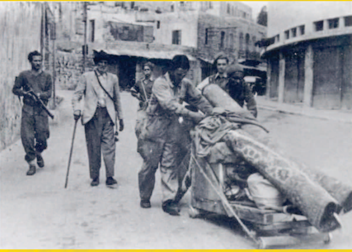
Palestinians forced from the city of Haifa by Israeli forces in 1948—nearly a million Palestinians were driven from their homeland during the "Nakba."

Right: Al Tanf Refugee Camp in Syria near the Iraq border. More than 1,000 Palestinian refugees fleeing targeted violence in Iraq in the aftermath of the U.S. invasion lived in tents in summer temperatures of 100 degrees and near zero winter weather—for four years. The camp was closed in 2010, with residents relocated to yet another refugee camp in Syria that the UN calls "slightly better" but "not sustainable."