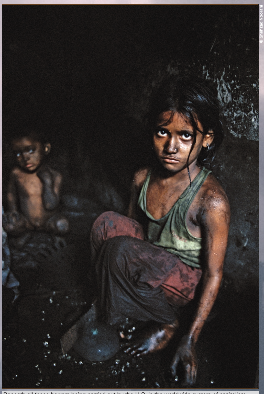
factory in Bangladesh.