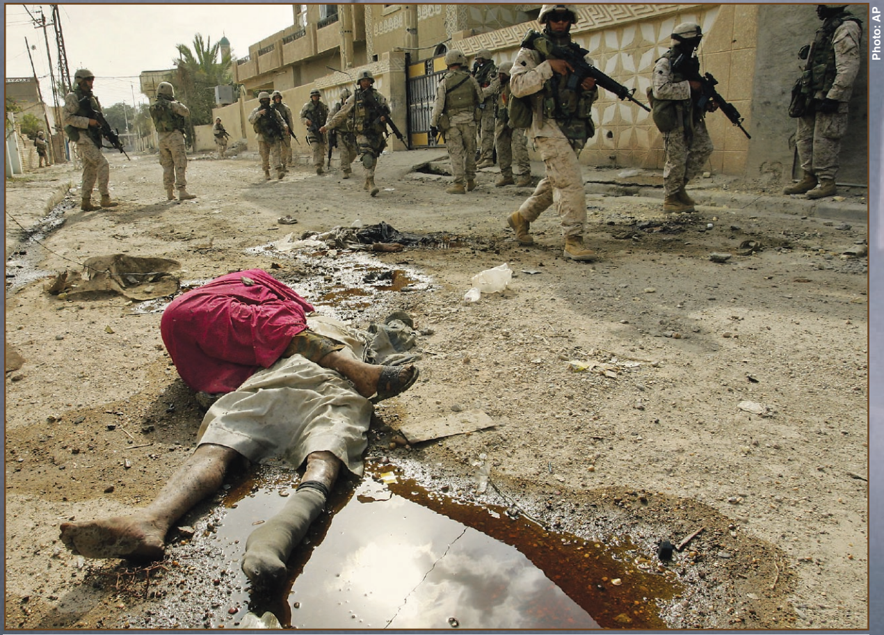
The carnage caused by the attacks on 9-11 has been multiplied perhaps a hundred-fold by the U.S. response in Afghanistan, Iraq, Pakistan and elsewhere. By 2006 there were at least 600,000 deaths in Iraq as a result of the U.S. invasion and war, according to a Johns Hopkins study published in the medical journal the Lancet. The number of dead civilians in the U.S. war in Afghanistan is unknown, but more than 2.7 million Afghan people are refugees. At least 2,050 people have been killed by U.S. drone attacks in Pakistan, and the toll is mounting. Above: U.S. troops in the Iragi city of Fallujah, which lay in ruins, with most of its people driven out and many killed, as a result of a brutal U.S. assault in November 2004