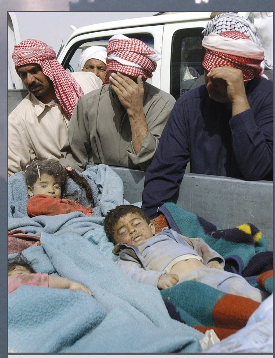
Five children younger than five years old were killed by U.S. troops in a raid on the Iraqi town of Ishaqi in 2006. The U.S. military then carried out an air raid on the town in an attempt to cover up the massacre, and cleared the troops of any wrongdoing.

Beneath all these horrors being carried out by the U.S. is the worldwide system of capitalism imperialism, which exploits billions of people, including children, like this girl laboring in a battery