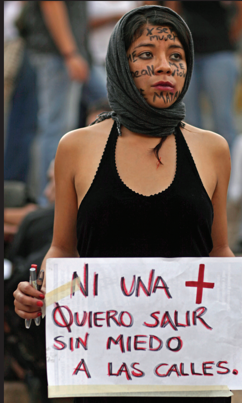
International Women's Day, Mexico City, 2011. English translation: "Not one more, I want to go into the streets without fear."

89% of all counties in the U.S. have no abortion provider.