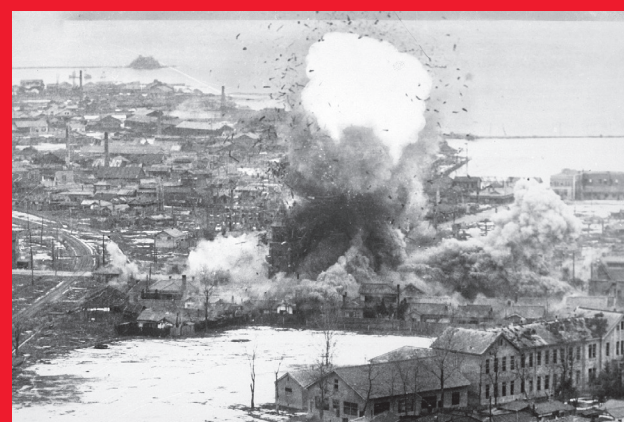
Wonsan, Korea bombed by U.S. AirForce, 1951

For much more on these and other crimes carried out by the U.S., go online to the American Crime series at www.revcom.us .