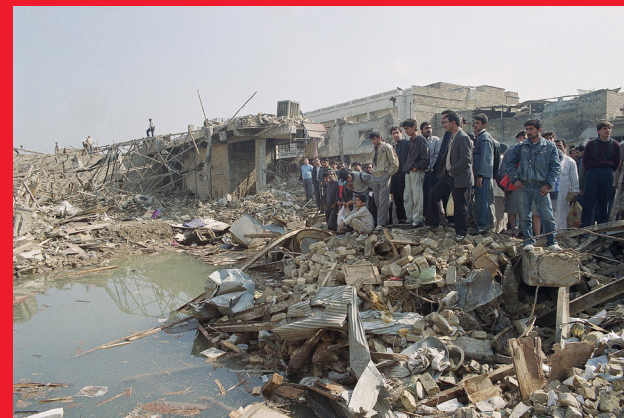
A bridge destroyed by U.S. air raids in Baghdad, Iraq 1991