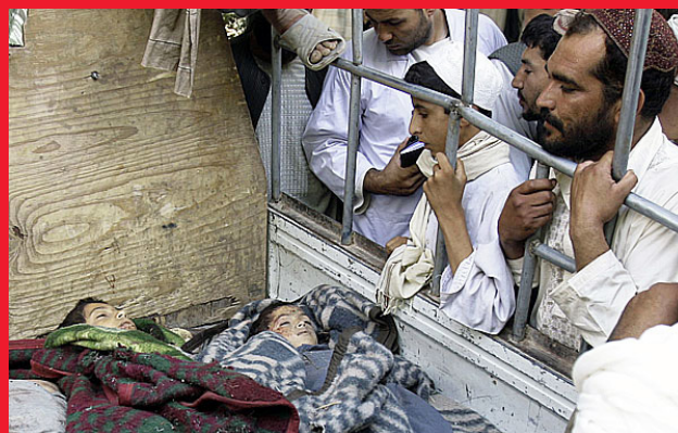
Relatives look at children killed by a 2009 U.S. airstrike in Kandahar, Afghanistan.

"[I]t is a basic truth that without breaking with American chauvinism—without confronting the very real horror of what this country has been, and what it has done, here and all over the world, from its founding to the present—and without coming to deeply hate this, it is not possible, in the final analysis, to retain one's own humanity and act in the highest interests of all humanity."