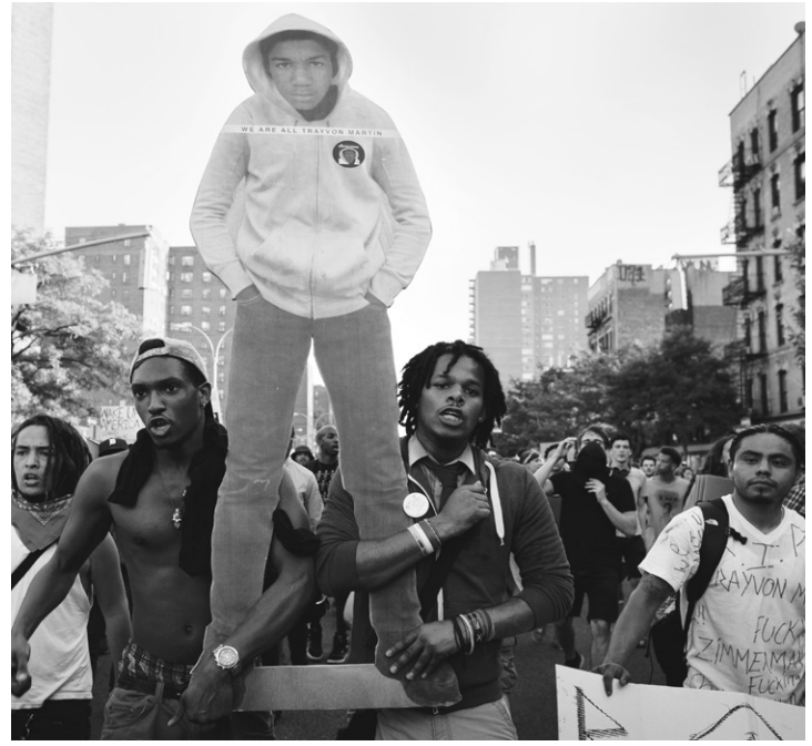
July 14, 2013, New York City. Marching from Union Square to Times Square after the not guilty verdict for the murderer of Trayvon Martin.

America has had its chances to do right by Black people. First through the Civil War and Reconstruction, and then during the 1960s, when people struggled mightily to deal with the horrors Black people faced. And each time, America changed the forms