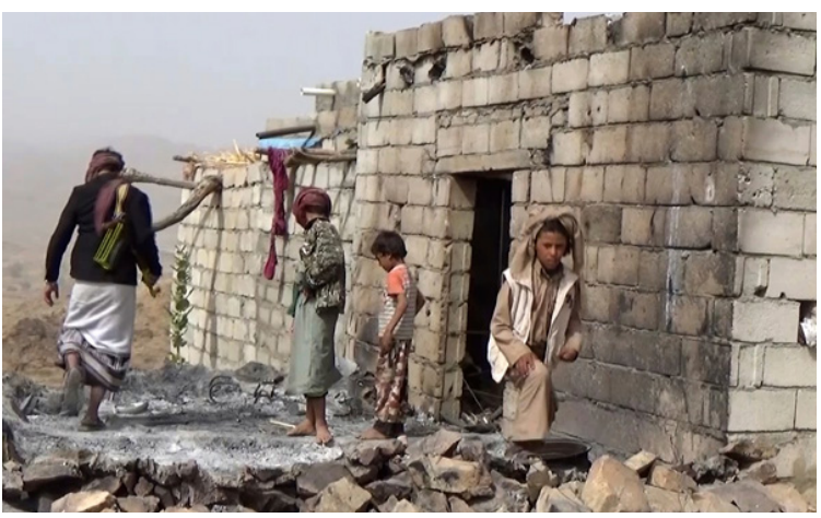
U.S.-backed Saudi Arabia airstrike on Yemen, 2015.

In March 2015, Saudi Arabia, with U.S. backing, launched a war against Yemen's Houthi movement. Since then, between 57,000 and 60,000 have been killed. The Saudis have bombed Yemen's food, water, and medical systems, causing massive hunger and disease. At least 85,000 children have starved to death as a result, and in 2016 and 2017 alone, 113,000 children died of starvation or preventable disease. Fourteen million Yemenis are on the brink of famine.