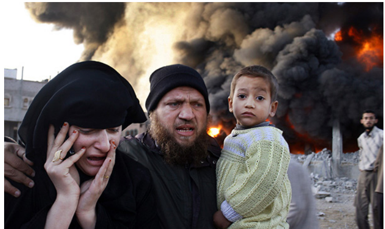
Palestinians in Gaza Strip after Israeli missile strike, 2008

The U.S. supported the foundation of Israel, which was created by defeating armies from Egypt, Jordan, Syria, and Iraq in war, and by violently forcing at least 750,000 Palestinians from their lands and homes. Zionist forces took more than 78 percent of historic Palestine, ethnically cleansed and destroyed about 530 villages and cities, and killed about 15,000 Palestinians in a series of mass atrocities. This is known as the Nakba (Arabic for catastrophe). Since then Israel has launched a series of aggressive wars in the region. Israel, backed with billions of dollars of U.S. aid annually, has increasingly functioned as a key U.S. proxy and attack dog.