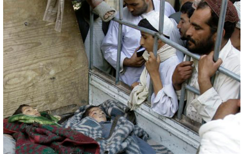
Children killed in U.S. air war in Afghanistan, 2009.

In 2003, the U.S. invaded Iraq and overthrew Saddam Hussein's regime based on the lie that Irag possessed weapons of mass destruction. The U.S. war and occupation sparked armed resistance and led to the rise of reactionary Islamic jihadism and the ethnic-sectarian conflict that continues to this day. Some studies estimate that between 1.2 and 1.4 million (and perhaps as many as 2.4 million) people in Iraq have died from the war's direct and indirect impacts. More than 4.2 million Iragis had been injured and at least 4.5 million driven from their homes by 2016.