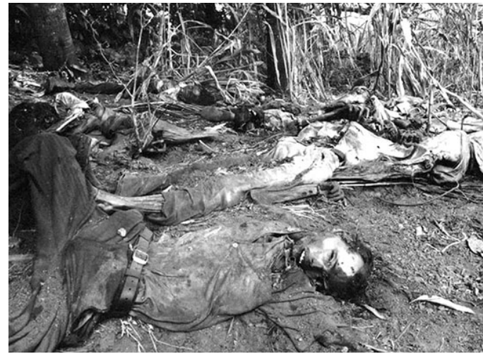
Massacre by U.S.-backed Salvadoran military in El Mozote, December 1981.

To crush a guerrilla struggle against its brutal client regime, the U.S. supported, funded, and armed death squads that carried out extra-judicial executions and massacres which killed as many as 75,000 Salvadorans.