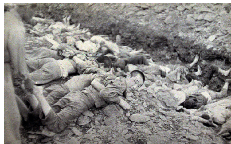
Mass execution of political prisoners by U.S.-puppet South Korean regime, July 1950.

In June 1950, the U.S. orchestrated a United Nations invasion of Korea, and sent over 340,000 American troops. U.S. and U.S.led forces killed more than two million North Korean civilians. 500,000 North Korean soldiers, and between 900,000 and a million Chinese soldiers. There were also 1.3 million South Korean casualties, including 400,000 dead.