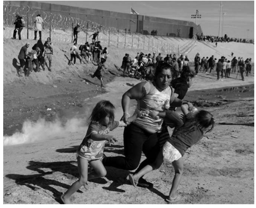
In November 2018, thousands of immigrants from Central America were stranded for weeks in Tijuana because the U.S. was deliberately slowing the entry of people seeking asylum. (This year, the Trump/Pence regime completely stopped accepting these asylum seekers.) These people had traveled thousands of miles from Honduras and other countries to flee intolerable violence, poverty and repression. During a peaceful protest march by these stranded immigrants, hundreds began running toward the border wall. The picture shows these immigrants, including small children, fleeing a tear gas attack against them by the U.S. Border Patrol.

(If you still think this is an exaggeration—going too far to say this about Trump—then you still don't know who Donald Trump really is. Look for Part 7: further evidence of Donald Trump as a genocidal racist.)