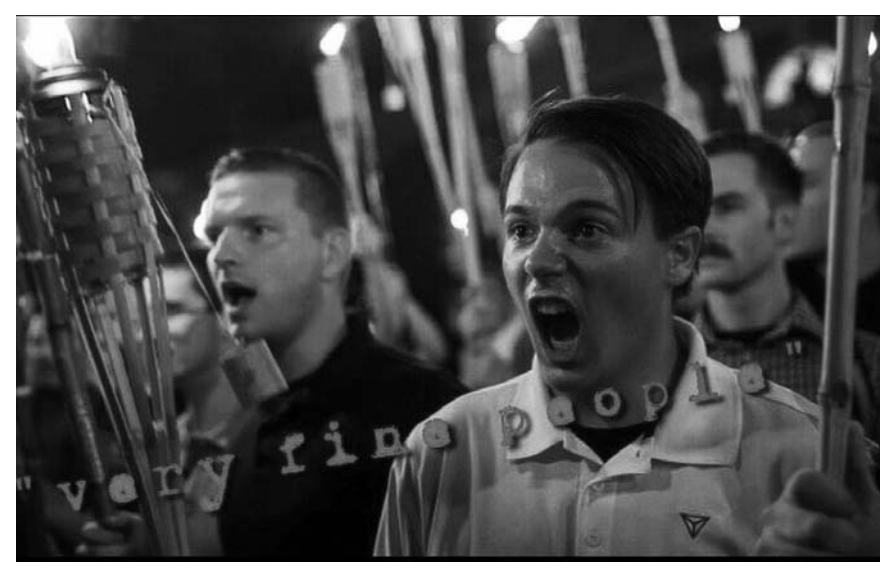
Fascists and white supremacists marching in Charlottesville, Virginia, August 2017. Trump called them "very fine people."

(If you think this is an exaggeration—going too far to say this about Trump—then you still don't know who Donald Trump really is. Look for Part 6: further evidence of Donald Trump as a genocidal racist.)