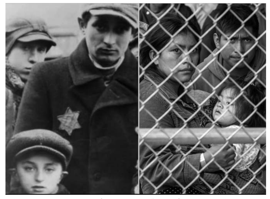
Left: A Jewish person in Nazi Germany with a "Yellow Star." Years before the Holocaust, Nazi officials forced Jews to wear the Yellow Star as a prelude to the mass deportations to ghettos and later to the death camps in Eastern Europe. Right: Some of the tens of thousands of immigrants who have been forced into concentration camps in the U.S. today under horrendous conditions—including children separated from parents and locked up in cages.

(If you don't think Trump would do something as extreme as killing off large parts of those he has demonized and criminalized, you still don't know who Donald Trump really is. Look for Part 4: further evidence of Donald Trump as a genocidal racist.)